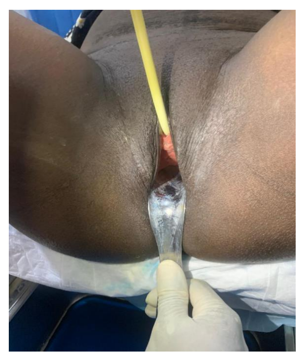
Figure 2 Intact Anterior Vaginal Wall In An Inaccessible Genitourinary Fistula

Physical examination revealed a sad-looking young woman. She was not pale and was well nourished. Her cardiovascular and respiratory systems were normal. Abdominal examination showed a transverse suprapubic scar. There was no tenderness, no